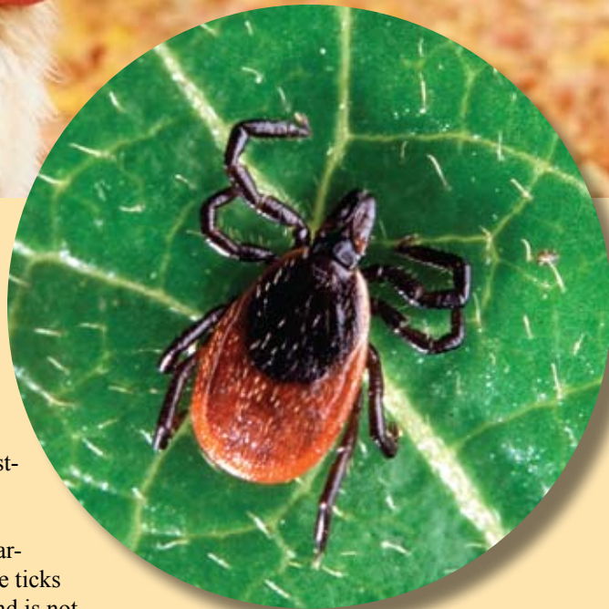
Above: Adult Deer Tick

To reduce the presence of all kinds of ticks in your yard, be sure to keep your grass cut short and your pets on veterinary-monitored tick preventatives. (There is a canine vaccine against Lyme disease and an annual booster as well.) Do not encourage deer and other wildlife to travel in your yard. Ask us to come out to inspect your yard for ticks and evidence of tick-infested urban wildlife. We can help by making suggestions for trapping and removal of urban wildlife, and also for lawn treatments with materials specific for keeping ticks away. ■