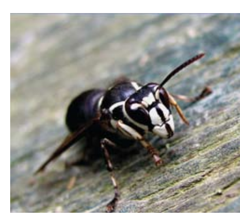
The bald-faced hornet sting can pack a real punch! Do not attempt to remove them yourself. Call us if you spot these pests on your property; we can help.

Bald-faced hornet nests are pretty recognizable, as are the hornets themselves. They are one of the few hornets with a white face (if you want to get close enough to take a look – however, this is not highly recommended!) These wasps are a pest that can really pack a punch when they sting you, especially when a whole colony continued on page 2