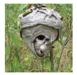
Bald-faced hornets are extremely protective of their nests and will sting repeatedly if disturbed.

Most complaints about foreign grain beetles come from people living in new homes. These beetles feed on the molds and fungi that grow on poorly seasoned lumber or wet plaster and wall boards. The beetles may also be attracted to accumulations of sawdust, which often occur behind walls as a by-product of construction.