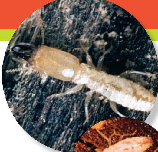
Left: Subterranean Termite Soldier