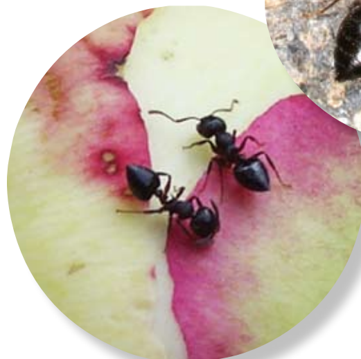
Left: Acrobat Ants on flower