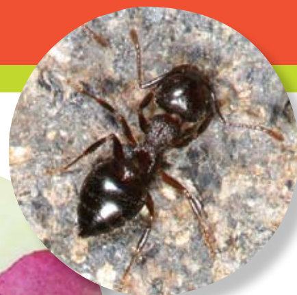
Above: Acrobat Ant