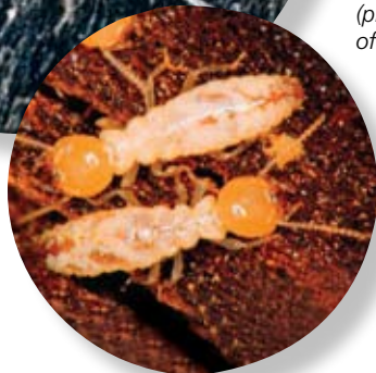
Below Left: Subterranean Termite Worker