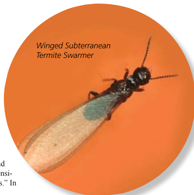
Winged Subterranean Termite Swarmer

Workers are small white insects. They are blind and very sensitive to heat, cold and dry air. This sensitivity is why they build shelter tubes or "mud tubes." In